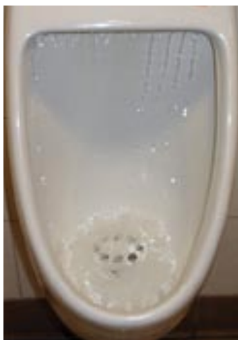
Top: Uridan waterless urinal

Well maintained, single stall, smart demand or manual flush urinals are the most efficient type of conventional urinal. They are only flushed after use, and flush volumes can be controlled.